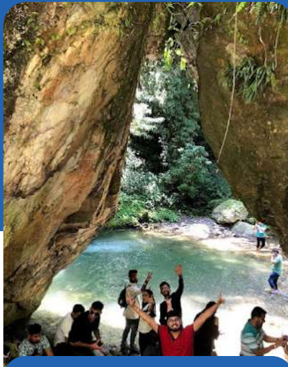
Jibhi & Tirthan Valley