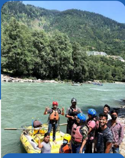
Manali & Sissu Lake

“Better to see something once than hear about it a thousand times.”